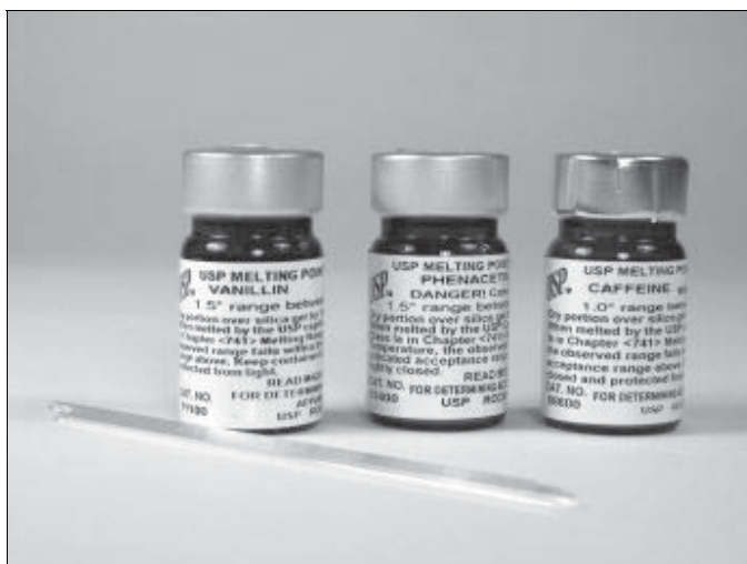
USP Pharmacopeial Convention CRSs.

The US Pharmacopeial Convention is the recommended source of CRSs for US Pharmacopeia protocols. A catalog is available as a download from their website ( www.usp.org ).