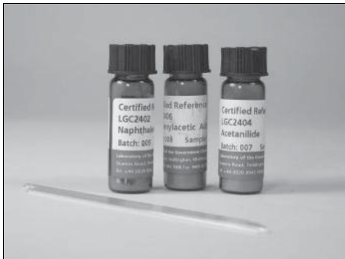
LGC Promochem CRSs