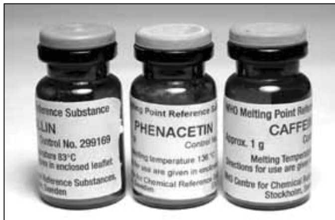
WHO Collaborating Centre for Chemical Reference Substances CRSs

WHO MP standards can also be obtained from LGC Promochem ( www.lgcpromochem.com ). LGC Promochem is currently the leading supplier of reference standards in Europe.